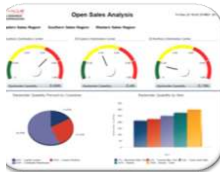
Real-time, tactical problem solving