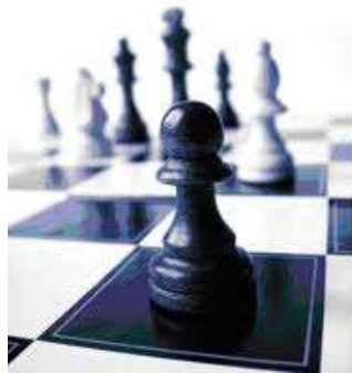
Plan and develop strategies