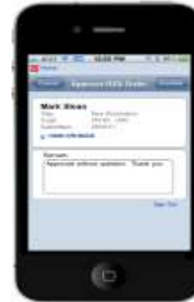
Get notified, take action