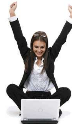
Make end users happy and productive